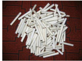
Mapacho (tobacco) Nicotiana Rustica (50units=$40)(100units=$70)