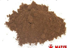
Rapé (Snuff) (of 3,4,5,7,10 plants) (10g=$28)(30g=$60)(100g=$100)