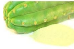
San Pedro Cactus Powder (50g=$45) (100g=$60)(200g=$85)