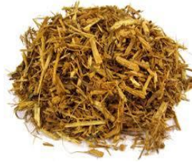
Ayahuasca Pure Banisteriopsis caapi (50g=$40)(100g=$60)(200g=70)