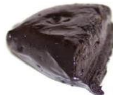
Strong B. Caapi Mix Paste 30X Caapi+Chacruna+Chaliponga (15g=$35)(50g=$55)(100g=$70)