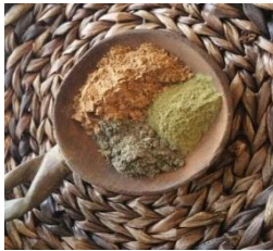
Ayahuasca Mix Caapi+Chacruna+Chaliponga (50g=$45)(100g=$60)(200g=$70)