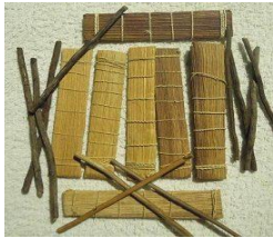
Kambo Phyllomedusa bicolor (1=$50)(3=$120)(5=$180)