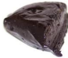
Strong B. Caapi Mix Paste 30X of 5 plants (15g=$35) (50g=$55)(100g=$70)