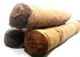
Mapacho Uncut Roll (1=1kg) Tobacco-Nicotiana rustica (500g=$60)(1kg=$80)(2kg=$130)