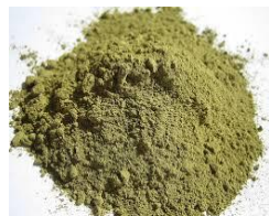
Chaliponga Diptopterys cabrerana (50g=$40)(100g=$60)(200g=$70)