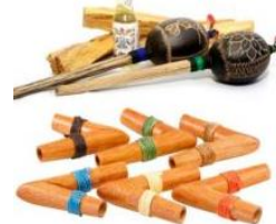
Native Art Kuripes, Tepis, Rattles, Pipes, Camalonga and more