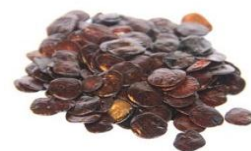
Yopo (Seeds) Anadenanthera Peregrina (25g=$30)(50g=$40)(100g=$50)