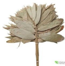
Chakapa Ceremony Ayahuasca (1=$40)(2=$69)(3=$89)